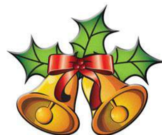
"Christmas Decorations in Radcliffe on Trent"