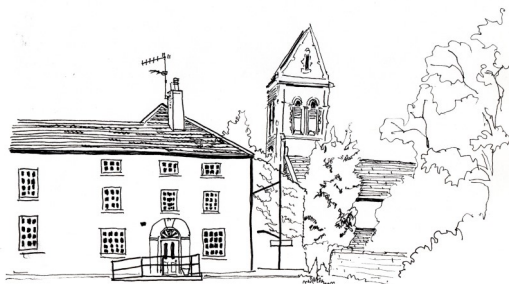
British Legion Hall 8 St Mary's Church, Radcliffe on Trent, Notts. 14.7.2020.