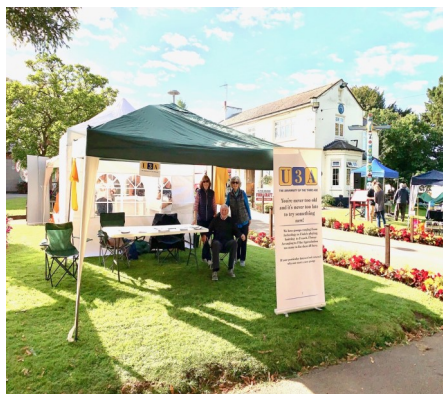
U3A STALL AT THE VILLAGE SHOW