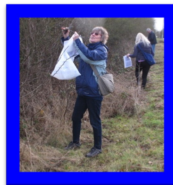
Hedge dating at Henson Lane.