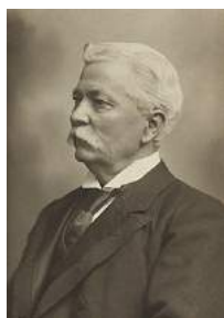
Henry Morton Stanley